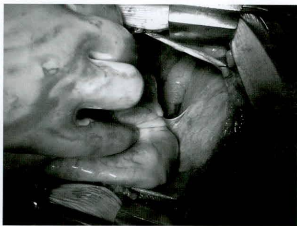
Figure 2. Surgical Aspect of Partial Agenesis of the Left Pericardium, Heart Rejected Earlier

ing of the anterior pericardium. A visual confirmation of was made, confirming that there was no pericardium on the left side, the heart was housed in the pleural cavity and the lung penetrated into the pericardial cavity (Figure 2). A neo pericardium with the use of three bovine pericardial patches® (Braile Biomedica - 18 * 12 cm), was confectioned. The patches were joined outside the operative field and anchored to the pleurae besides the posterior portion of the heart and remaining pericardium's anterior part.