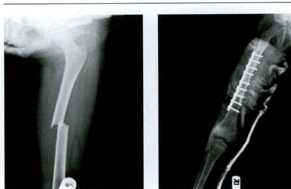
Figure 1. A Pair of Radiographs: Initial Referral and Post-Fixation

treated with DCP ( the plates had been removed 18 to 22 months after installation) (Figure 1).