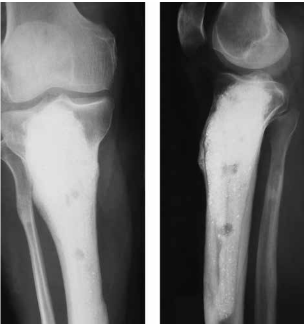
Figure 3. Post-Operative Plain Radiography of the leg-AP and Lateral

Although, there were previous reports on recurrence of lesions after 5 years in similar investigations (23), we observed no recurrence during study follow-up. It might be due to extensive and enough curettage of cavity, the use of hypertonic saline and/or continued and completed medicinal treatment by patients post-operation.