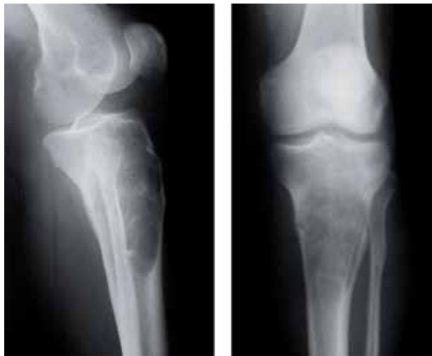
Figure 1. Pre-Operative Plain Radiography of the leg Showing a big Lytic Lesion in Proximal Tibia-AP and Lateral

At the end, the cavity was filled with bone cement (PMMA) mixed with gentamicin (2 g of antibiotic per 40 g cement). Elastic bandages used for the patients and in the next day, weight bearing (WB) on extremities was commenced. Antibiotic therapy with oral Mebendazole 60 mg/kg per day started the day after surgery and continued for all the patients for six months. In search of additional lesions in other organs, we evaluated for a possible cyst in lungs or hepatobiliary system (Figure 2).