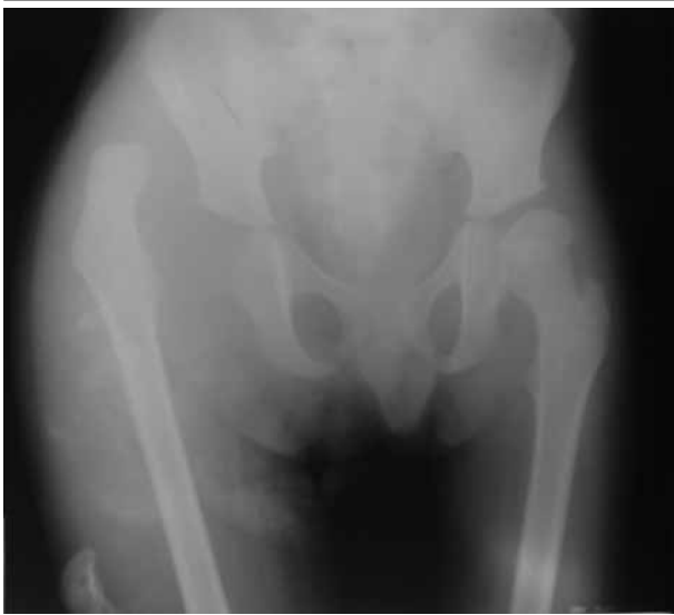
Figure 2. Ap View of the Pelvis Radiography Shows Proximal Dislocation of Femoral Head and Epiphysal Separation of Femoral Head

application of traction, the remnant of femoral head was placed in the acetabulum and immobilized with spica cast.