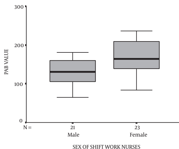
Figure 3. Comparison of Pro-Oxidant-Antioxidant Balance (PAB) Value Between Male and Female Shift-Working Nurses (Mean and the Standard Error/Standard Deviation of PAB Value)

In shift work nurses there was a significant difference of PAB value between males and females ( P = 0.002 ).