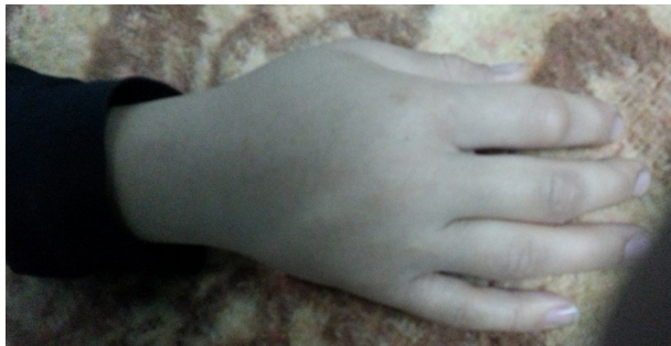
Figure 1. Moderate Swelling of Right Hand

According to the results described above and based on the diagnostic criteria proposed by Warin (10), the patient was diagnosed with APD. After symptom resolution, the patient remained under observation but the symptoms did not return and due to stable and normal health condition, the patient was discharged with the prescription of Prednisolone 50 mg and ranitidine 150 mg tablets for one week.