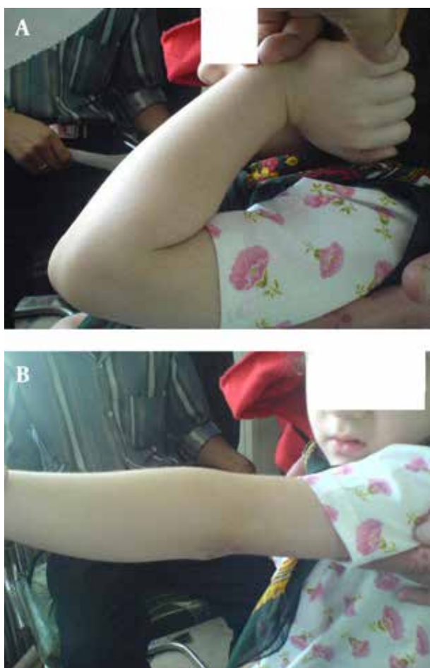
Figure 2. Three Weeks After Surgery, Patient Achieved Full Flexion and Extension in Elbow Joint

After surgery, the muscle was released to the primary site and there was no need to repair fascia or muscle. After insertion of the drain, skin and subcutaneous tissue were restored. Half an hour before and 24 hours after surgery, 3 doses of intravenous antibiotic, first-generation of cephalosporin type, were administered and the organ was immobilized for 2 weeks (with splint). Active assisted flexion and extension movements started after 2 weeks, and we removed the splints (3-6 weeks) by x-ray control after solid union.