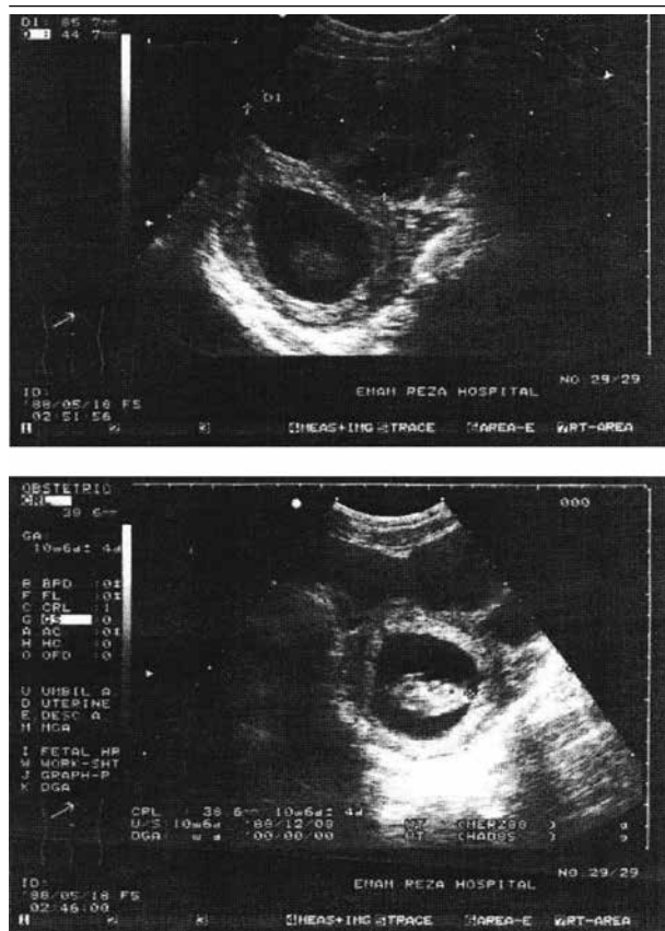
Figure 1. Uterus Ultrasound of the First Case

The first case of spontaneous OHSS was described by Rothman in 1989. He described hypothyroidism as a predisposing factor (15). The second one was reported by Zalel in 1992 (16). Other similar cases also described PCOS as only predisposing factor (17). Another case of spontaneous OHSS was reported by Ayhan in 1996. He did not report any evidence of thyroid or PCOS factors (14). No other factors evaluated by Ayhan. Other limited cases