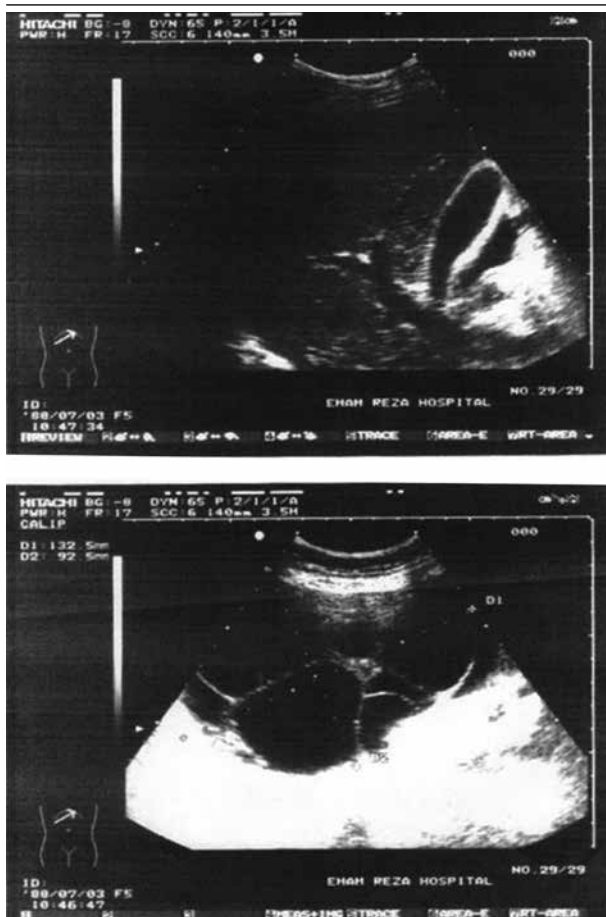
Figure 3. Hyper Stimulated Ovary in the Second Case

of spontaneous OHSS have been reported in literature. Some cases suggest some predisposing factors and some others suggest polycystic ovarian syndrome (PCOS) as an underlying factor (14, 17, 18).