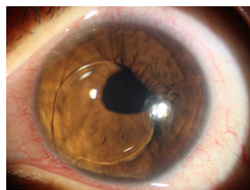
Figure 1. Photograph of a 42-Year-Old Iranian Woman with Lens Dislocation Into the Anterior Chamber

A 42-year-old Iranian woman was referred to the department of ophthalmology, Bina Eye hospital in June 2014 with complaint of sudden deterioration of vision in his left eye one day prior to admission but without any pain. No other abnormalities was detected on general physical examination. Furthermore, past medical history and familial history of the patient were unremarkable with no other history of trauma in the left eye. Ophthalmic examination using slit lamp biomicroscopy revealed IOL dislocation into the anterior chamber (Figure 1). Intraocular pressure (IOP) was 15 mmHg in left eye and 14 mmHg in right eye. No capsular fibrosis was detected in both eyes and no zonules were seen around the dislocated lens. Also, no pseudo exfoliation of the lens capsule was identified in either eye.